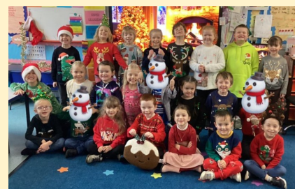
Knypersley First School @KnypersleyFirst · 3h Class 2 have had a surprise today! Our elf, Elfs Presently, has been busy drawing on our bananas! #cheekyelf #countdowntochristmas 🍌🎅🦋 @ChildrenFirstLP